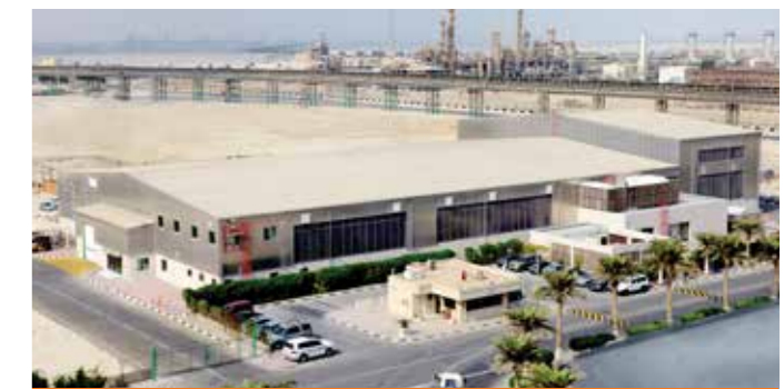
QAFCO WAREHOUSE, QATAR