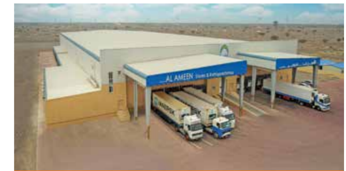
AL AMEEN STORES & REFRIGERATION, OMAN