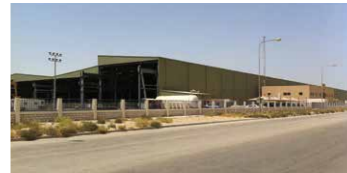
CLEVELAND BRIDGE FACTORY, SAUDI ARABIA