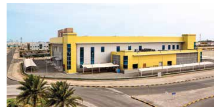
BAHRAIN PHARMACEUTICAL FACTORY, BAHRAIN