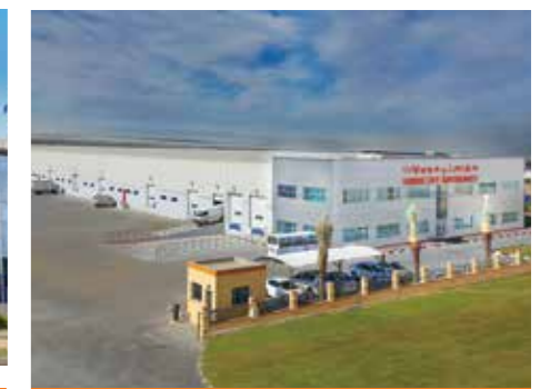
SUNRISE CITY SUPERMARKET, UAE